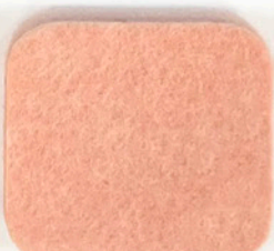
Pink 24mm only

!!! Please note that the above colors are representative of the actual colours which may vary in shade or texture. We are able to provide actual panel samples upon request. !!!