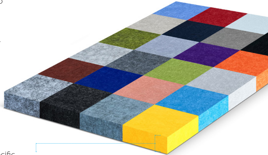
Sound Absorbing Polyester Thickness: 24mm

Our desk screen have been designed to a very specific density to achieve the correct acoustic performance and are available in 24mm thickness.