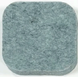
Marble Smoke Blue